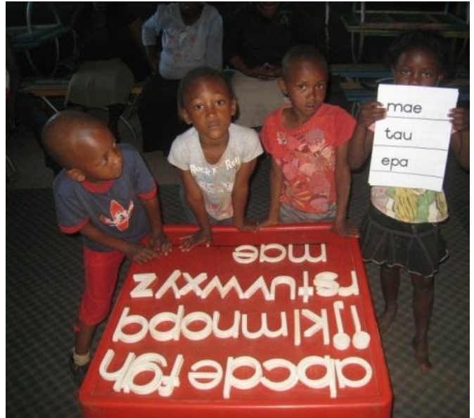
Step 2 - Writing phonic words