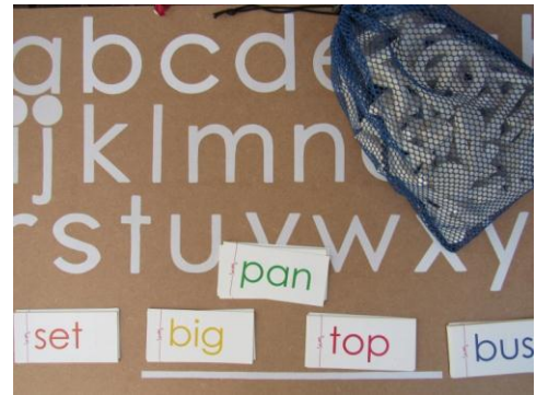
Step 1 - Learning the sound symbol link by ear, eye and touch

Step 2 is to build simple phonic words by “pulling out” the sounds of a word (building and writing