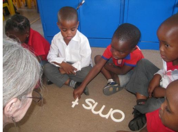
SOUNDS - The tools, a letter set, a spelling board and phonetic written words