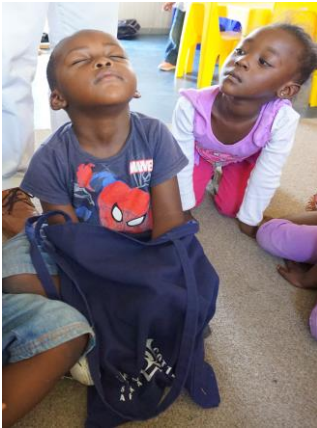
A child searches for a letter by touch - a key component of the SOUNDS learning method. The teachers pick it up quickly as well.