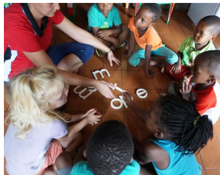
The children demonstrate their knowledge of the first six letters taught in the SOUNDS programme

Two frustrations occurred during the week. Despite many attempts, we were unable to meet with staff of the Gauteng Educational Department and staff at the Peace Corps head office. Both contacts are important and in the coming weeks efforts will be made to meet with these organisations.