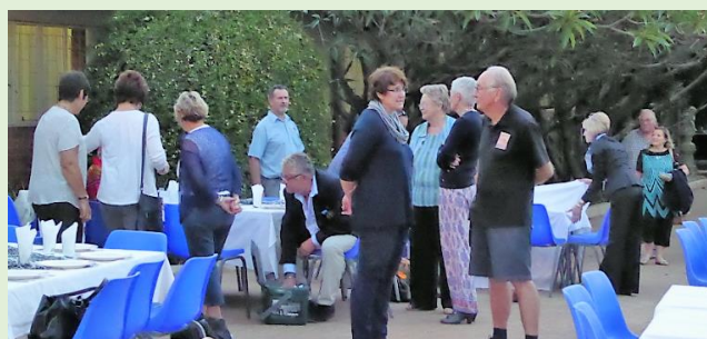
Friends of Meerhof School for the disabled gathering for a pleasant evening together