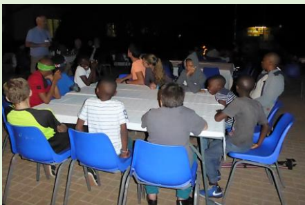
Well-behaved pupils waiting for their food