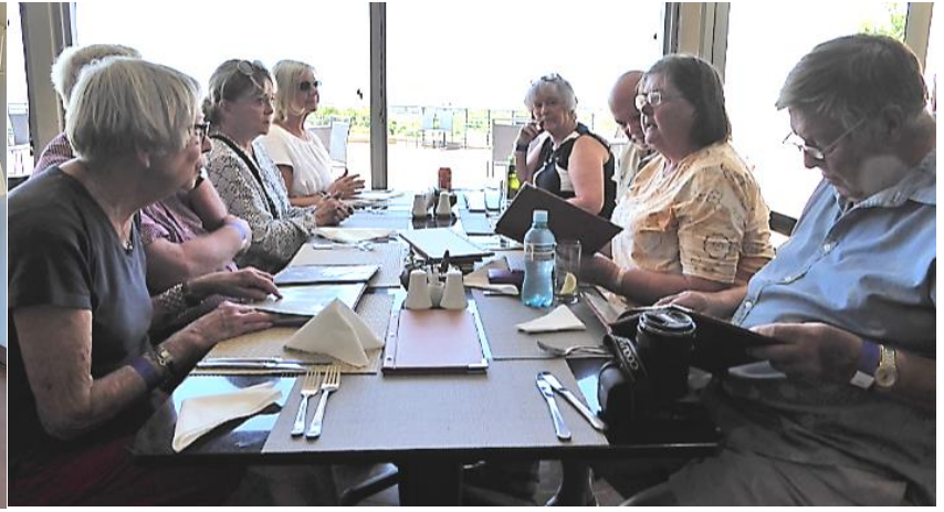
After all the walking at Maropeng, lunch was a welcome relief to rest weary feet and relax over a nice meal