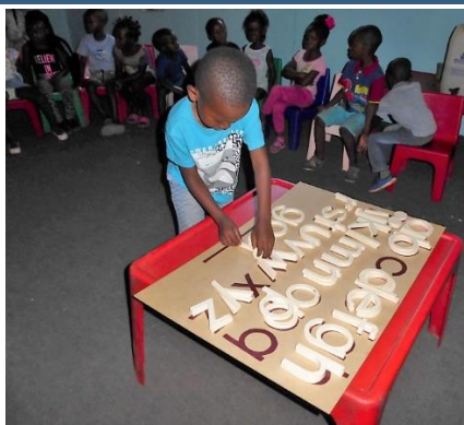
A young learner shows how he has mastered the art of sounding and spelling