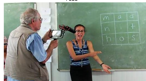
The kids were creative - a matrix of letters turned into three letter words

Having been serenaded by marvellous choirs at one school, wined and dined and submerged in the local SOUNS culture, (building three-letter words from a noughts and crosses puzzle, splitting up three letter words down your arm), the return trip on 18<sup>th</sup> was highlighted by the stories and memories from the last three days.