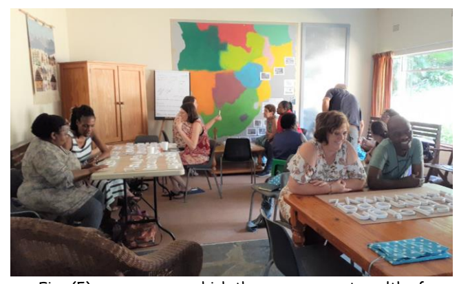
Five (5) groups among which there was a great wealth of appropriate experience so that each group had a natural leader.

Many teachers from the Kamagugu School for the mentally challenged located just outside White River. Their insight into how the tactile properties of SOUNS would be an asset was fascinating to hear. They received one set of SOUNS letters.